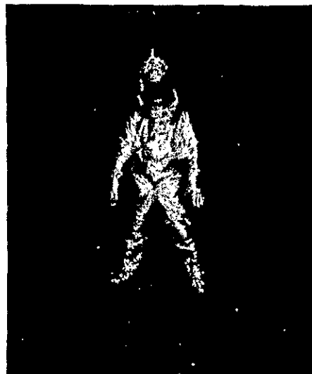
Strikingly similar photograph to the one taken by Chief Greenhaw.